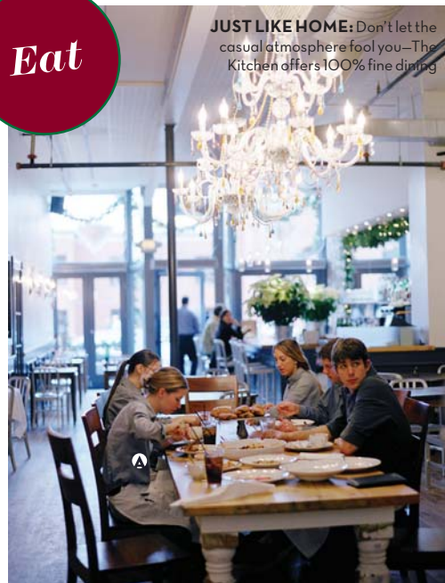
JUST LIKE HOME: Don't let the casual atmosphere fool you—The Kitchen offers 100% fine dining