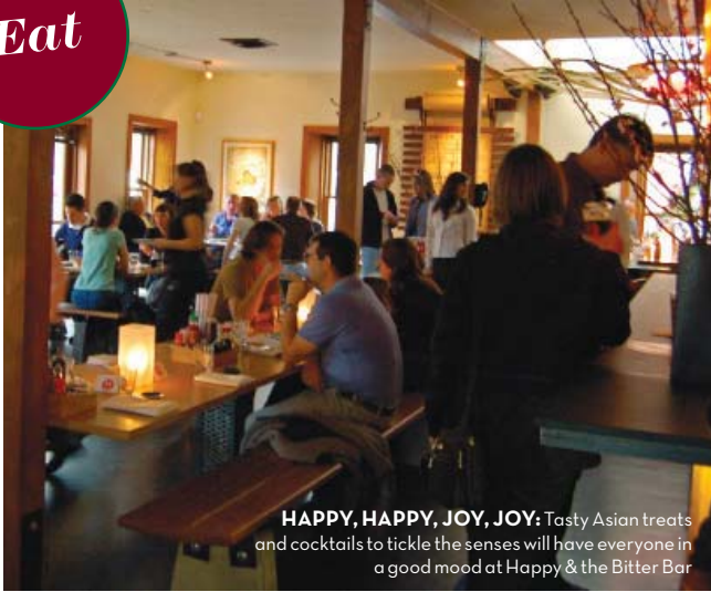
HAPPY, HAPPY, JOY, JOY: Tasty Asian treats and cocktails to tickle the senses will have everyone in a good mood at Happy & the Bitter Bar