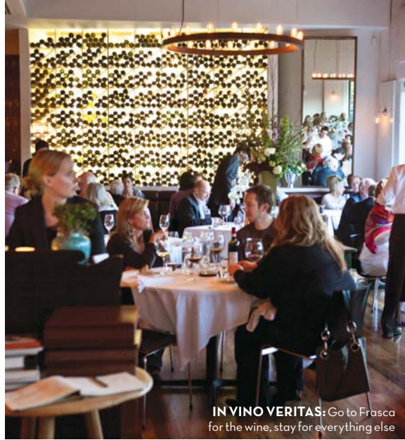
IN VINO VERITAS: Go to Frasca for the wine, stay for everything else

Pearl Street Mall , Boulder's outdoor gathering place, features one-of-a-kind, independently owned shops, boutiques, galleries, and more. Some top picks include Peppercorn for kitchen, bath and home accessories, Barbara & Company for cool women's clothing, and West End Gardener for year-round gardening needs. For home projects, supplies or just plain tinkering, 60,000-square-foot McGuckin Hardware on Arapahoe Avenue (ask any local for directions) has been the go-to place since 1955.