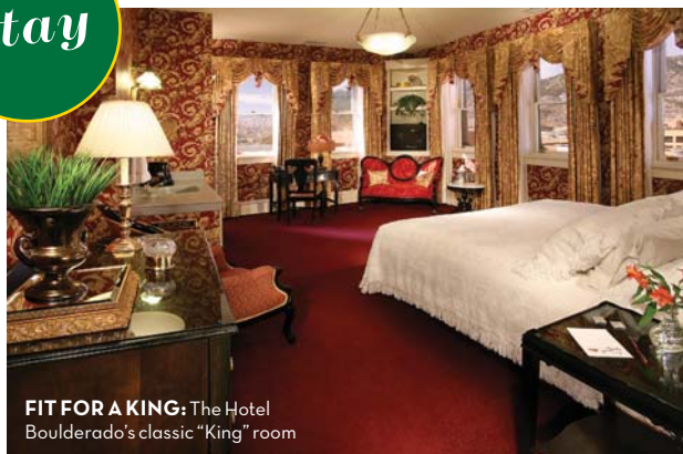
FIT FOR A KING: The Hotel Boulderado's classic "King" room